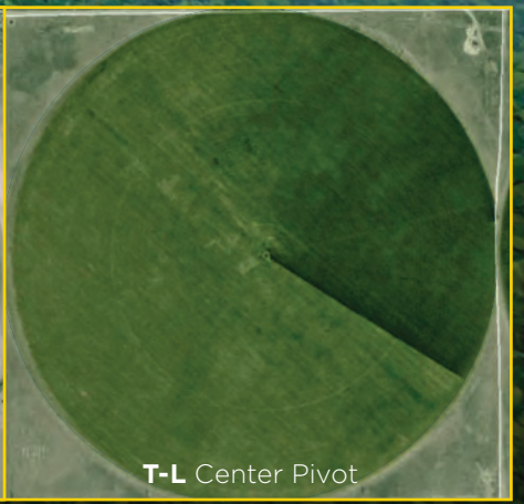
T-L Center Pivot