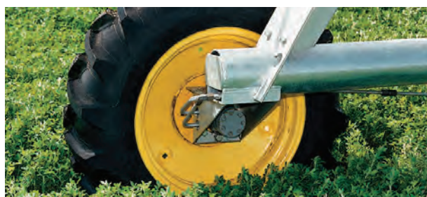
Planetary Gear Drive

CONTINUOUS MOVEMENT MEANS EXTENDED GEAR LIFE