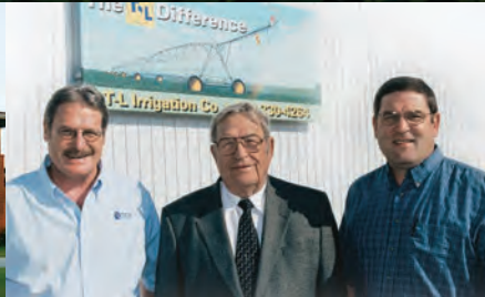
Experience and Dedication Since 1955.