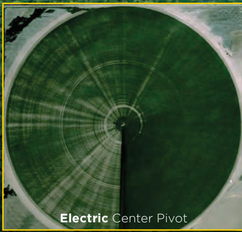
Electric Center Pivot

Eliminate the “ SPOKING ” effect caused by the start-stop operation of electrically-powered pivot irrigation systems and get the benefits of even water distribution and maintenance cost savings.