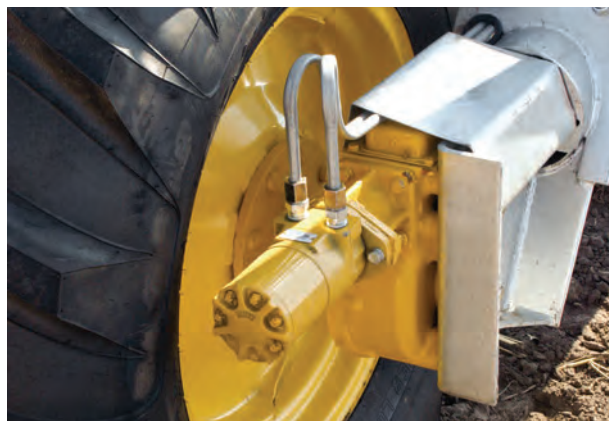
Worm Gear Drive

T-L planetary and worm gear options are totally enclosed and coupled directly to the hydraulic motor eliminating the center gear drive, U-joints and other exposed moving parts found on electric pivot systems. Hydraulic motors and gear boxes are both easily accessible for maintenance.