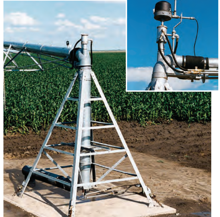
Pivot point available with hydraulic swivel or wrap hoses. Inset photo shown with collector ring and strobe light.

There is no wasted horsepower with a T-L because the power required to run the pump varies directly with the rotation time of the pivot. All T-L Irrigation Systems utilize environmentally friendly Hydroclear™ hydraulic fluid with an additive package specially designed to provide superior wear protection. The filtered hydraulic system assures long life.