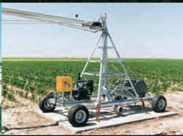
4 Wheel Towable Systems