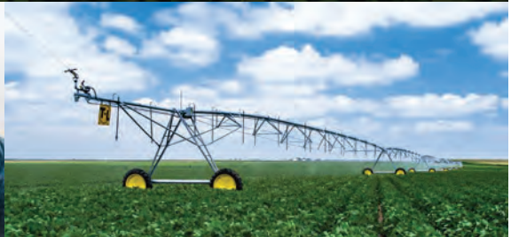
Conventional Pivot Systems