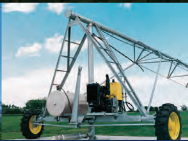
Quick Tow Systems