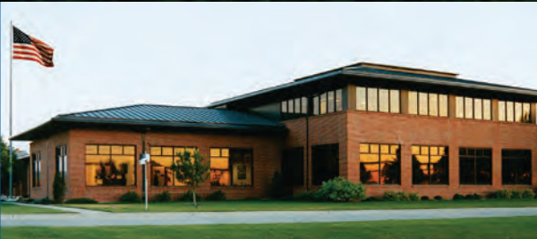
T-L Home Office at Hastings, NE