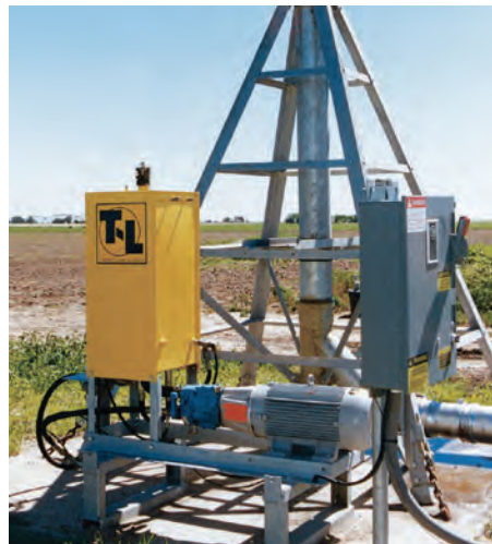
Electric Motor Single or 3-Phase