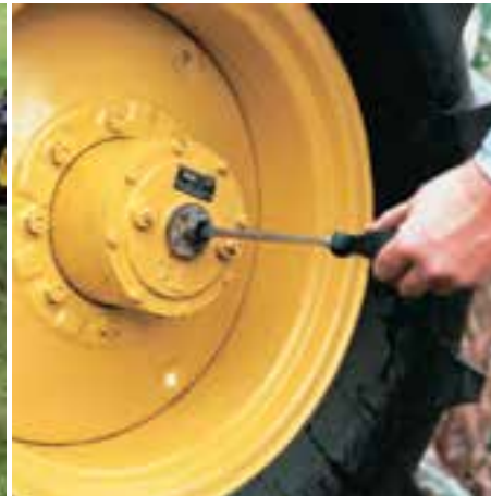
Gear boxes free-wheeled