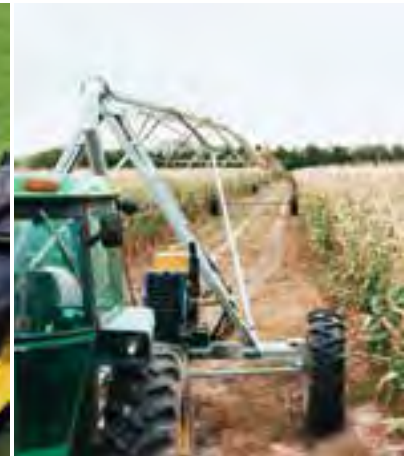
Towing the system