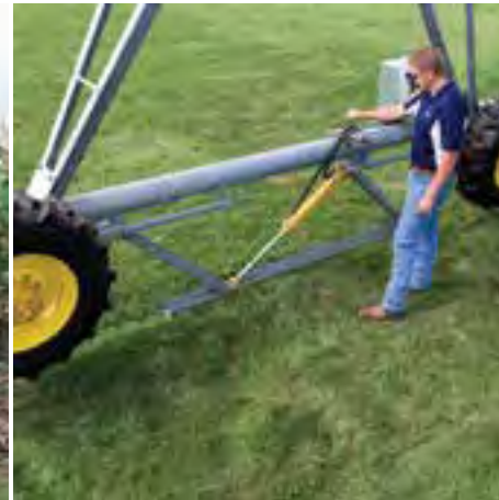
Rotate wheels 90°