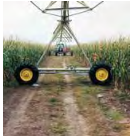
System stopped on tow-road

DEPENDABLE AND SAFE HYDRAULIC POWER MAKES IT POSSIBLE.