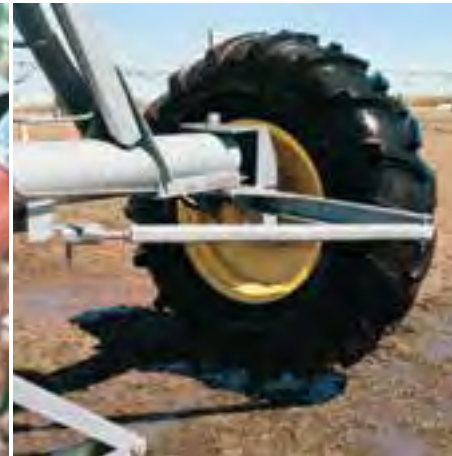
Wheels turned, lower the tower