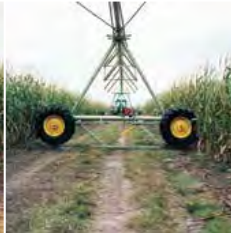
Tower raised by T-L scissor jack