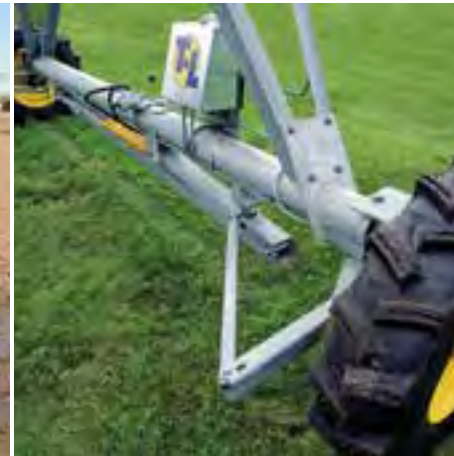
Ready for towing - Less than one minute per tower