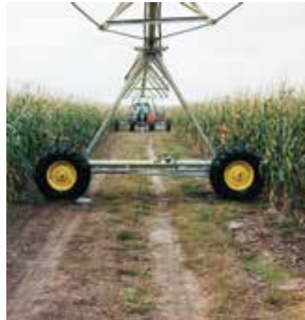
System stopped on tow-road

DEPENDABLE AND SAFE HYDRAULIC POWER MAKES IT POSSIBLE.