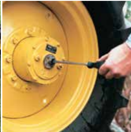
Gear boxes free-wheeled