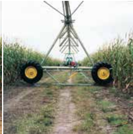
Tower raised by T-L scissor jack