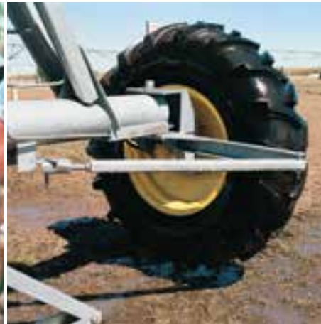
Wheels turned, lower the tower