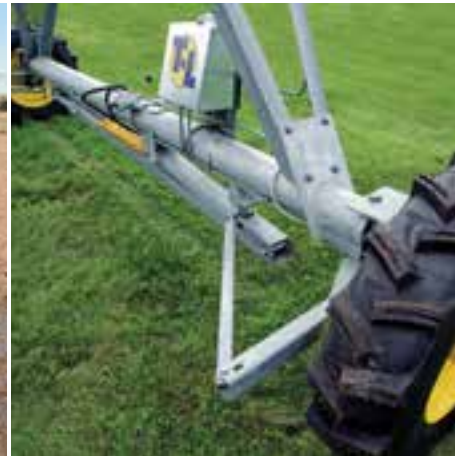
Ready for towing - Less than one minute per tower