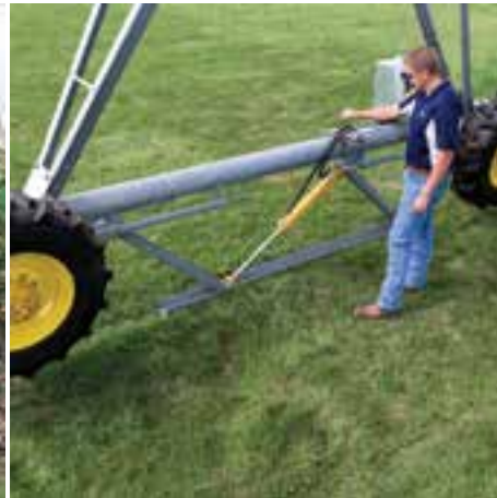
Rotate wheels 90°