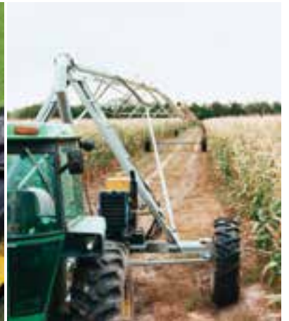
Towing the system