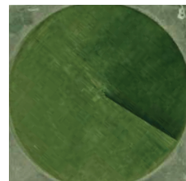
T-L Hydraulic Centre Pivot